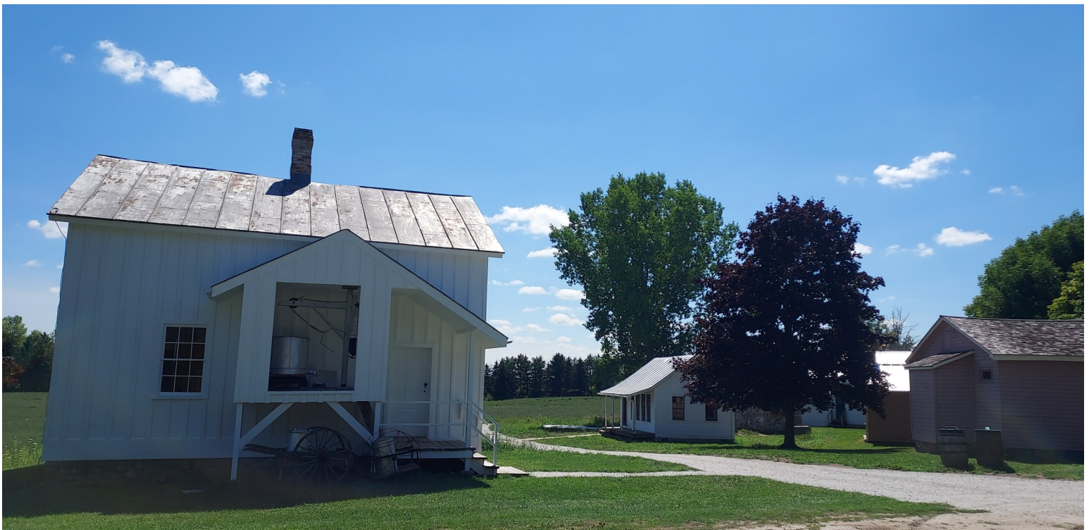
Newly restored Cheese Factory, at the left, with the new road to the Krueger Sawmill and a new location for the Print Shop.

In the little over 20 years that our Cheese Factory has been on site, it has quickly grown to be one of the favorites for our school tours, youth programs, and our annual Thresheree program.