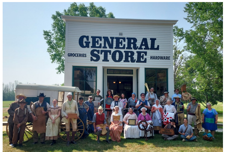
Artists gathered outside the General Store during the Heritage Maker's Market in June.

MCHS, in partnership with Seehafer Broadcasting and WOMT-Radio have a weekly radio broadcast called "Our History Our Story". You can find all of our weekly five-minute podcasts on our website. The podcast brings stories from our museum to life. Be sure to listen to an all new episode of Our History, Our Story every Friday morning at 11:25 on WOMT 1240 AM radio.