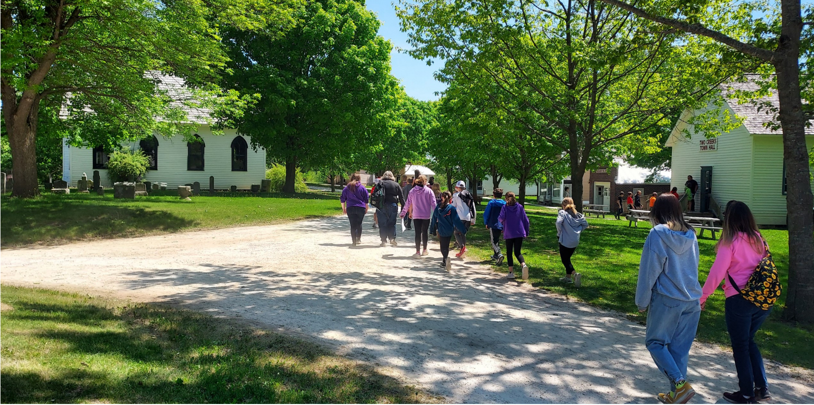
Guests walk the Museum and Village grounds in Summer, 2023.