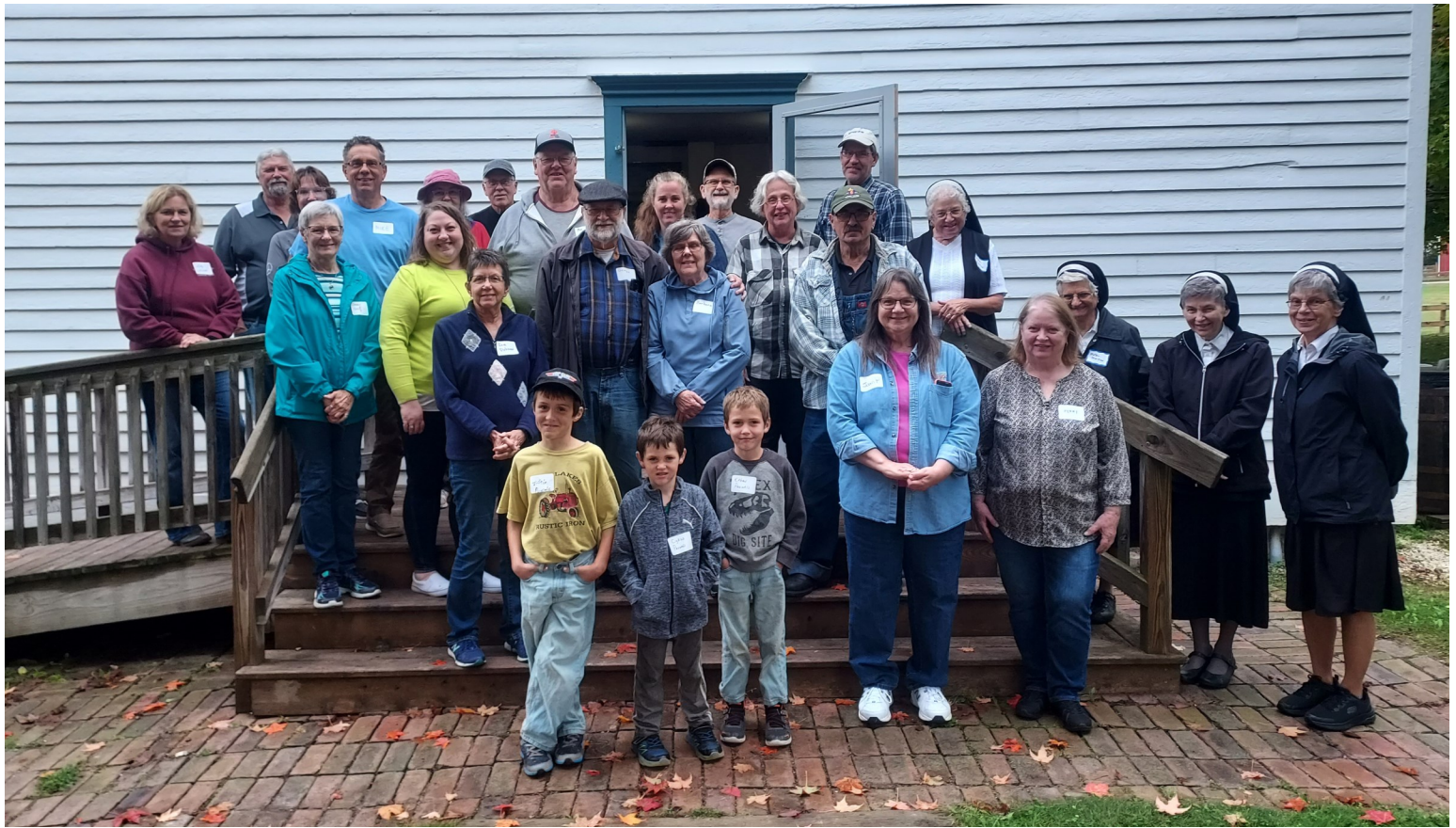
Volunteers gathered outside the Two Creeks Town Hall in September 2023 for the annual volunteer picnic.