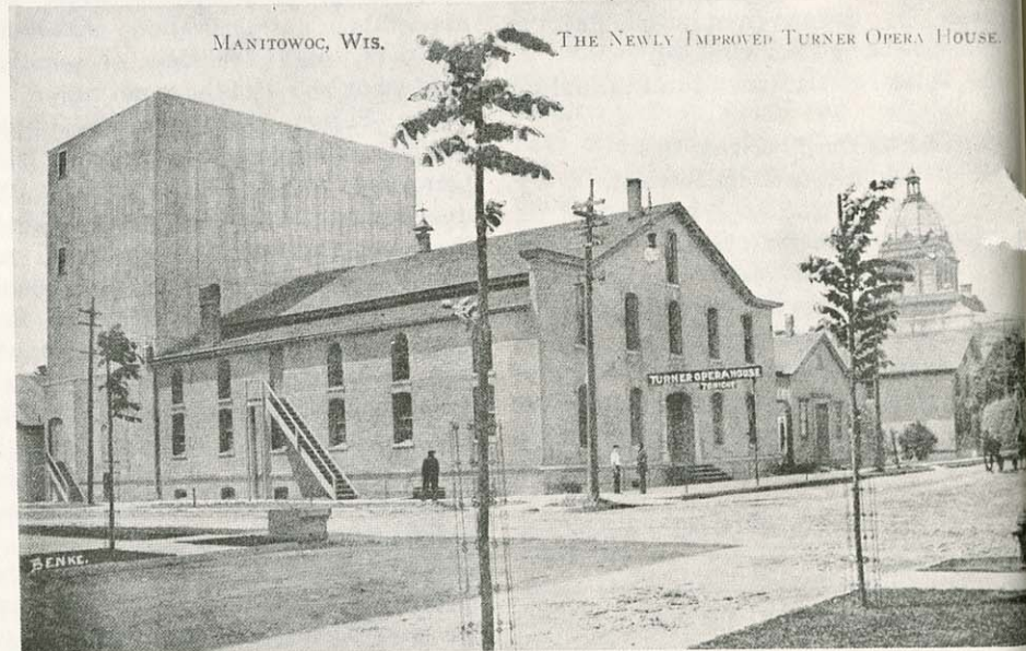
Turner Opera House, later Orpheum, Razed in 1932.

Down through the years in carefully kept records and minutes, much early history of the Turner Opera House, one of the early day amusement places of Manitowoc, are disclosed. The building, in late years known as the Orpheum, was razed by the Rahr Malting company in 1932 to remove a fire hazard.