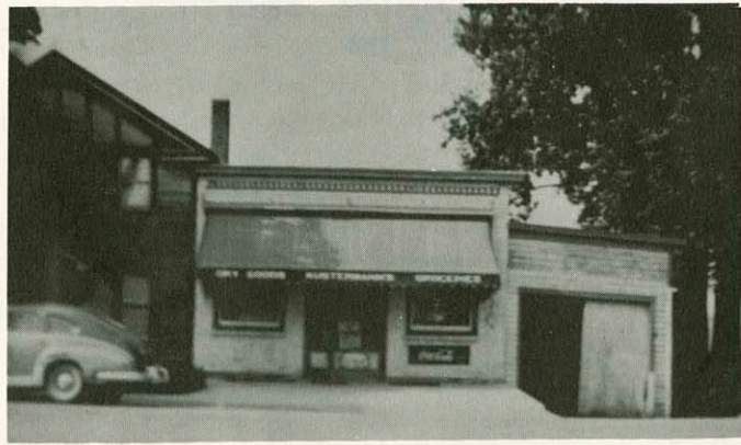
Kusterman's Store in 1941

Conditions under which a mercantile establishment is operated today, of course, are quite dif-