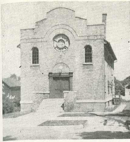
Congregation Anshe Poale Zedek erected this brick building in 1925, replacing a wooden structure on same site. Brick building, above, was sold in 1953 to the Seventh Day Adventists.

however, that the presence of the shipyard added substantially to the economic wealth of the general community, which attracted Jews and non-Jews alike to Manitowoc. Some of the early Jewish settlers did not remain in Manitowoc. For reasons of family unity or economic well-being, they moved to Minneapolis, Milwaukee or Chicago. But in view of a balanced ratio between emigration and immigration, the Manitowoc Jewish community has remained fairly static over the last 25 years.