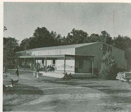
Dining Lodge which in 1959 replaced the one destroyed by the storm.