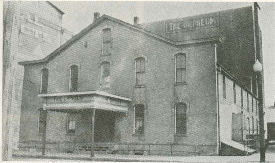
The Orpheum was acquired in 1921 and sold in 1927.