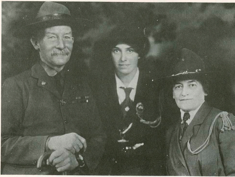
Sir Robert Baden-Powell (founder of the Boy Scouts), Lady Baden-Powell and Juliette Low, 1919.

During the first year of Council operation under professional leadership, Scouting grew in Manitowoc from three active troops with 56 registered Scouts to eight troops with 176 registered Scouts.