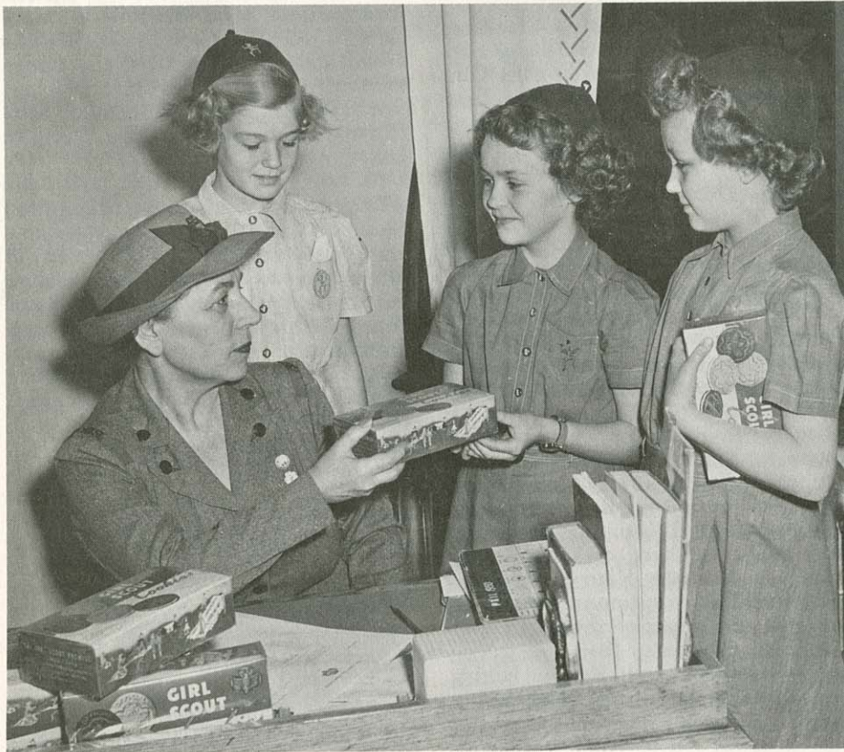
SELL GIRL SCOUT COOKIES — The Girl Scouts of Two Rivers sold more cookies in 1950 than in any previous year.

As a result of a national study of the Girl Scouts of the U.S.A., a plan of action was put into effect. In 1960 the National Council delegates approved the idea and development of a program change, designated to streamline and consolidate the Girl Scout program, including a change in the age groupings of troop members from three to four age-levels and the development of new handbooks and training materials by 1963. The National Council directed all councils to