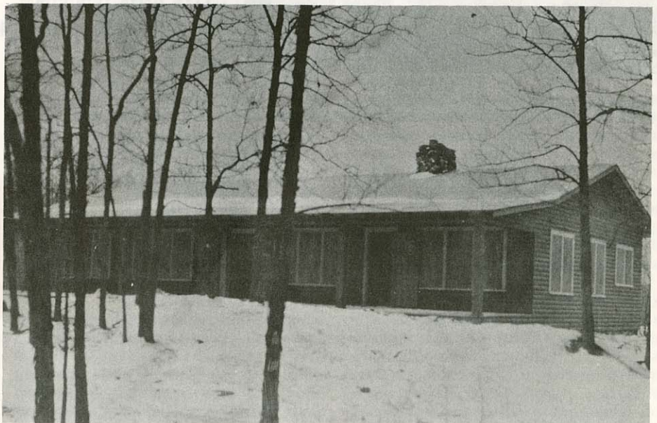
Camp Sinawa lodge which was destroyed in a storm in 1958.