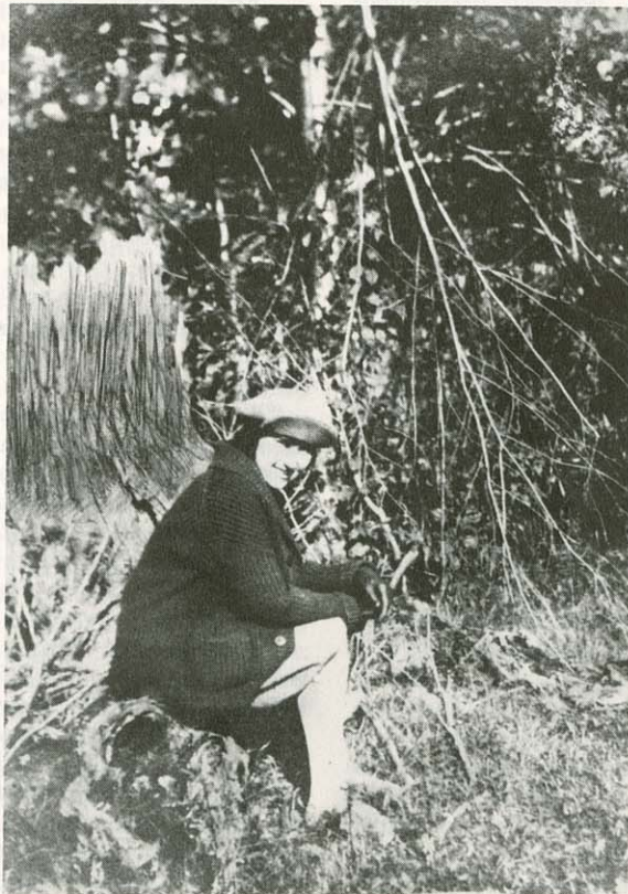
Blackened bottom of stump is a result of the 1871 Peshtigo Fire in northern Manitowoc County.