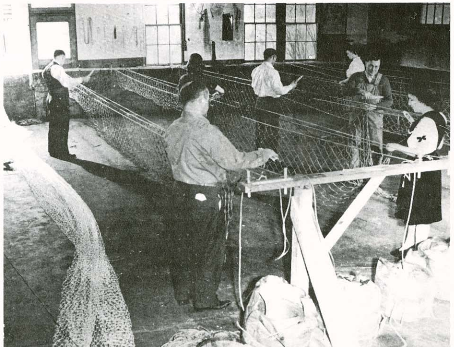
Carron Net Company workers making nets. Photo appeared in The Milwaukee Journal on February 27, 1944. The caption read "A typical factory scene — the equipment is simple but the workers must be skillful."