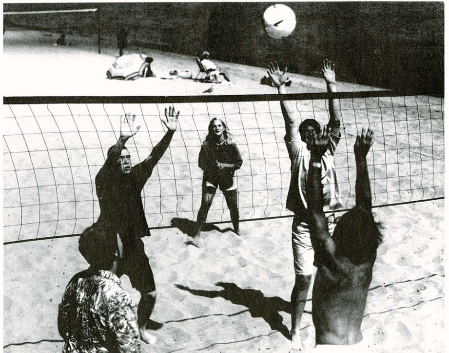
Today, Carron Net Company makes a variety of standard recreational volleyball nets for both indoor and outdoor use, as shown in this photo from the company's sales catalog. It also produces made-to-order sports nets for tennis, basketball, baseball, golf, soccer, football, climbing, track and field, and archery.