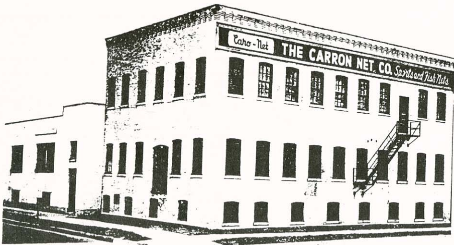
Main plant of the Carron Net Company, 1623-17th Street on the southeast corner of 17th and Monroe Streets, Two Rivers. This historic photograph shows how the 2-1/2 story brick commercial building appeared, probably in the 1940s. The undated photo appears on the front cover of a four page pamphlet titled The Carron Net Co. Story , on file at the company. The sport and fish net manufacturer's motto at the time was "The Best..Always the Best..For Our Customers..".