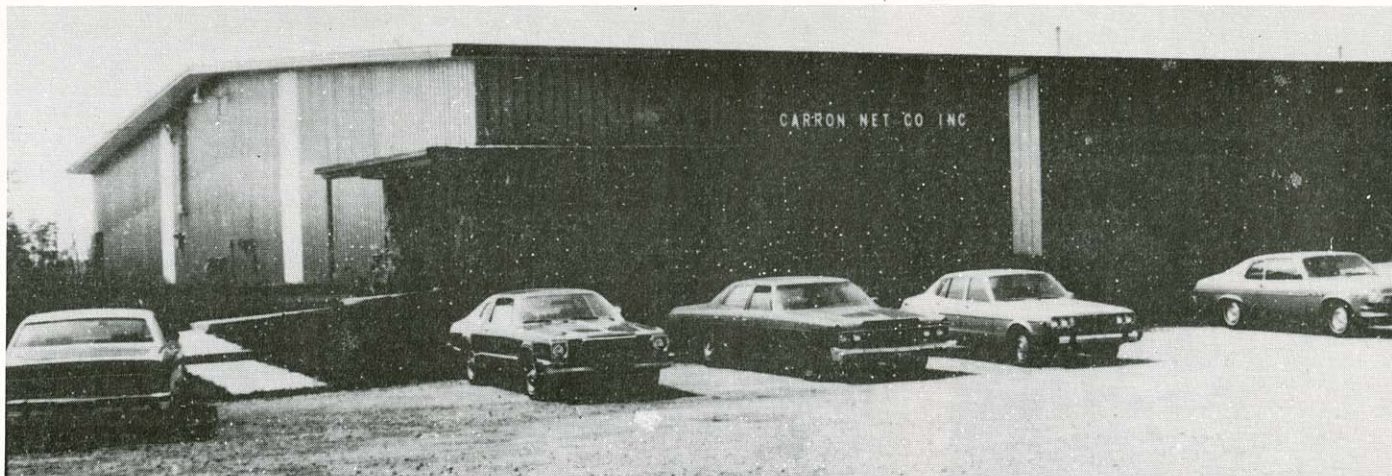
The Carron Net Company built a second plant facility in 1976 and 1977 so large nets could be made indoors. Prior to that, this work was done outdoors and was governed by weather conditions. The large space indoors allowed the company to increase production and provided more room for twisting machinery to manufacture cordage. The plant is located at 2200-27th Street on six acres of land near the West Twin River in Two Rivers. Photo appeared with an article about the company in the Herald-Times-Reporter, July 22, 1979.

As the 1970's approached the business kept expanding and growing. Tennis became very popular and this period is referred to as the tennis boom. Employment doubled from about 30 to 60 employees. During these years the Company began exporting some of its products overseas to the Caribbean area, Venezuela, Mexico, Canada, Germany and Saudi Arabia.